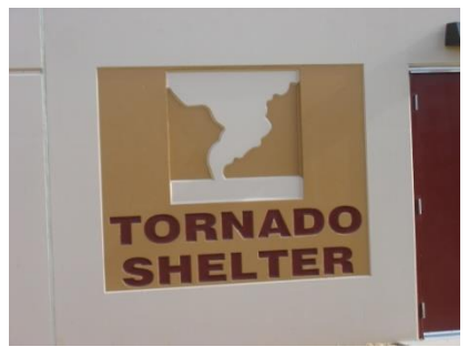
Suitable Living Environments